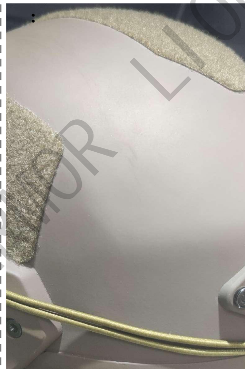
♥ Rubber coating (Smooth)