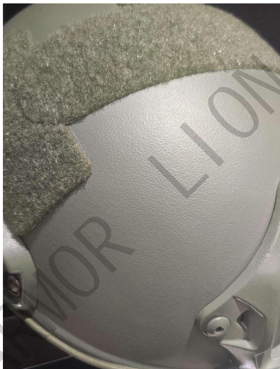
♥ PU coating (90% products are this one)